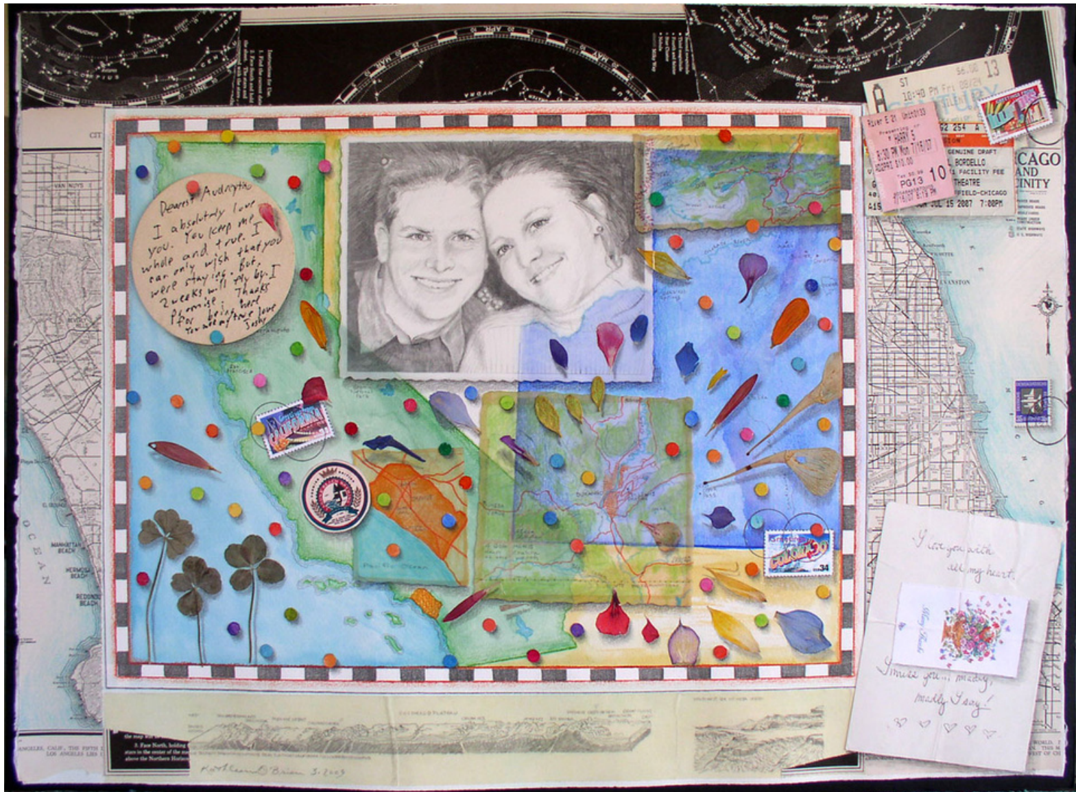
"Treasured Map for A and J", Kathleen O'Brien, 22x30", 2008 Private Collection