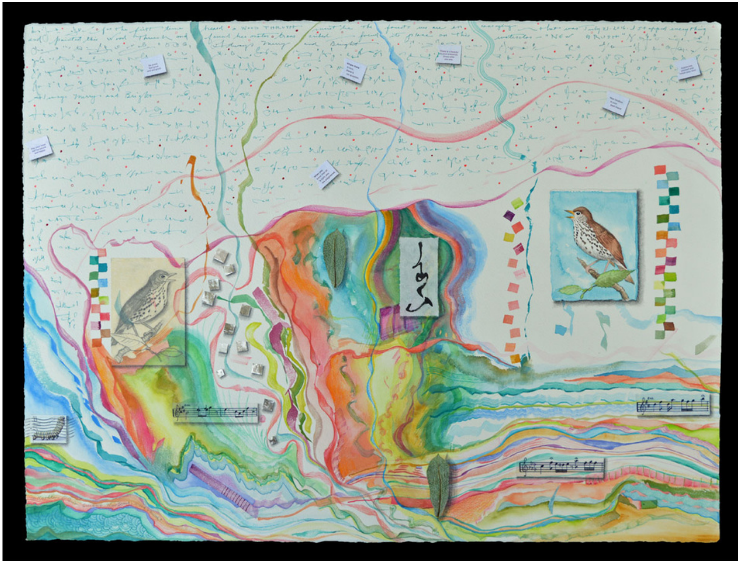
"New Brush, Wood Thrush", Kathleen O'Brien, 22x30", 2016 Private Collection