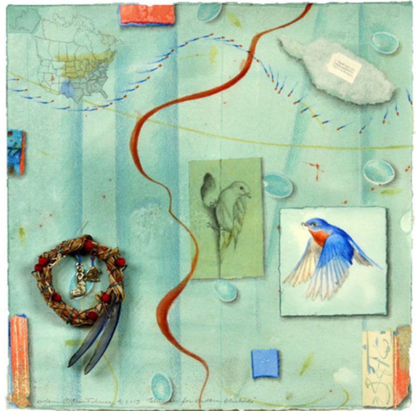
"Talisman for Western Bluebirds and Talisman for Eastern Bluebirds", Kathleen O'Brien, 20x20" each, 2015 Private Collection