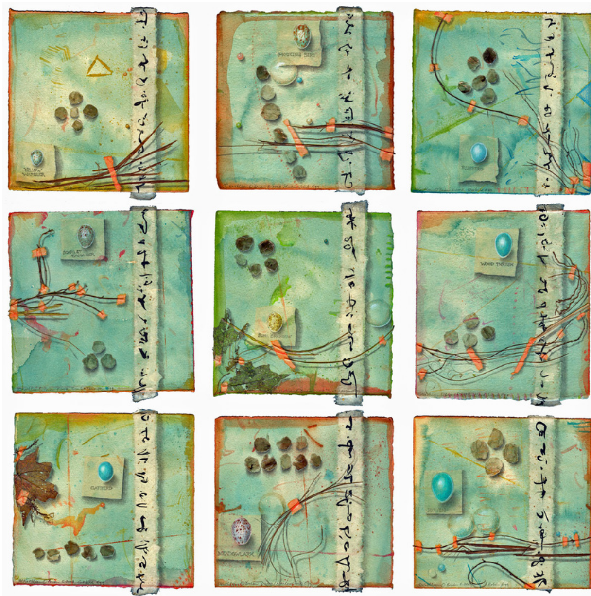
"Nine Bird Eggs", Kathleen O'Brien, 30x30", 2008