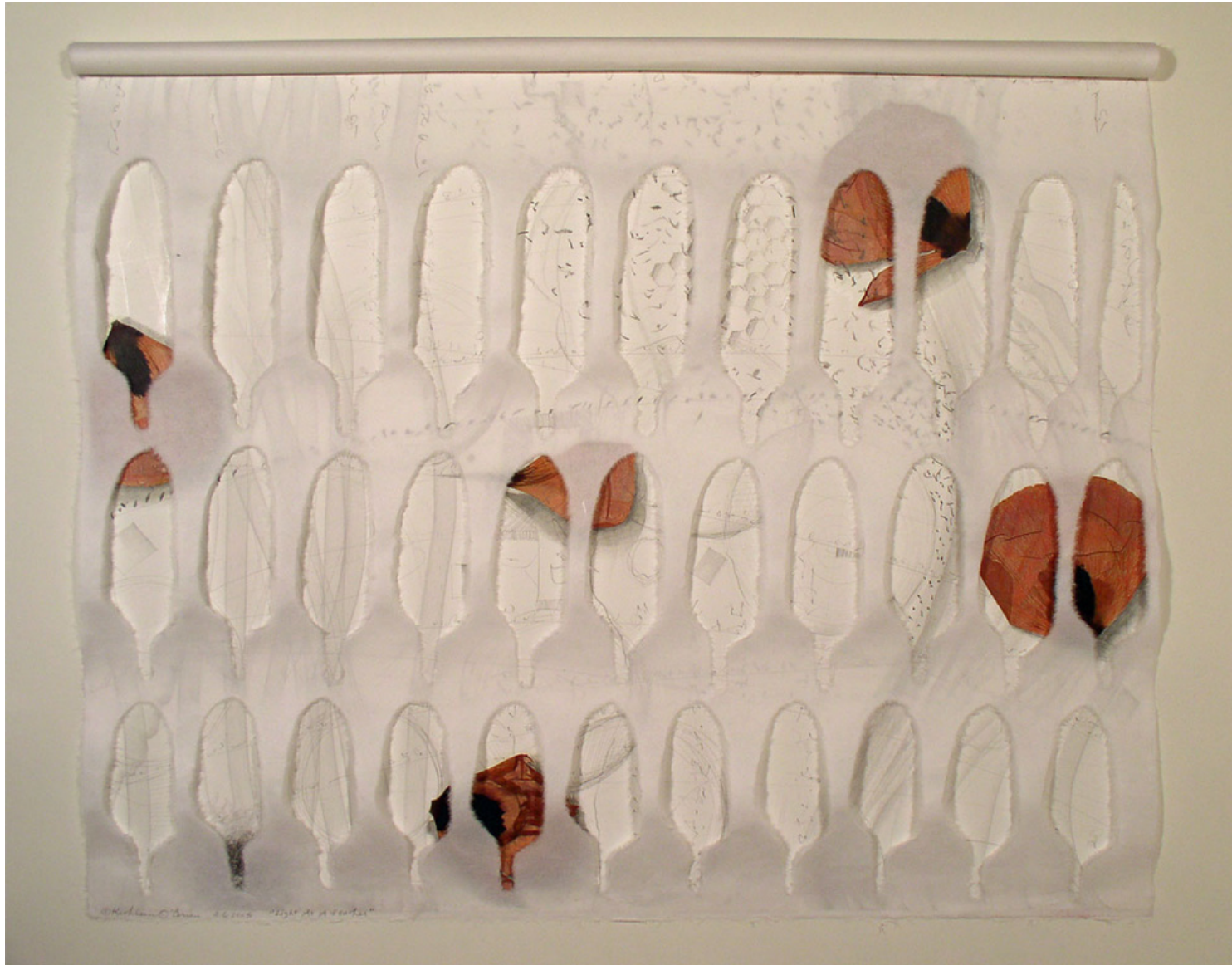
"Light, As a Feather", Kathleen O'Brien, 22x30", 2005