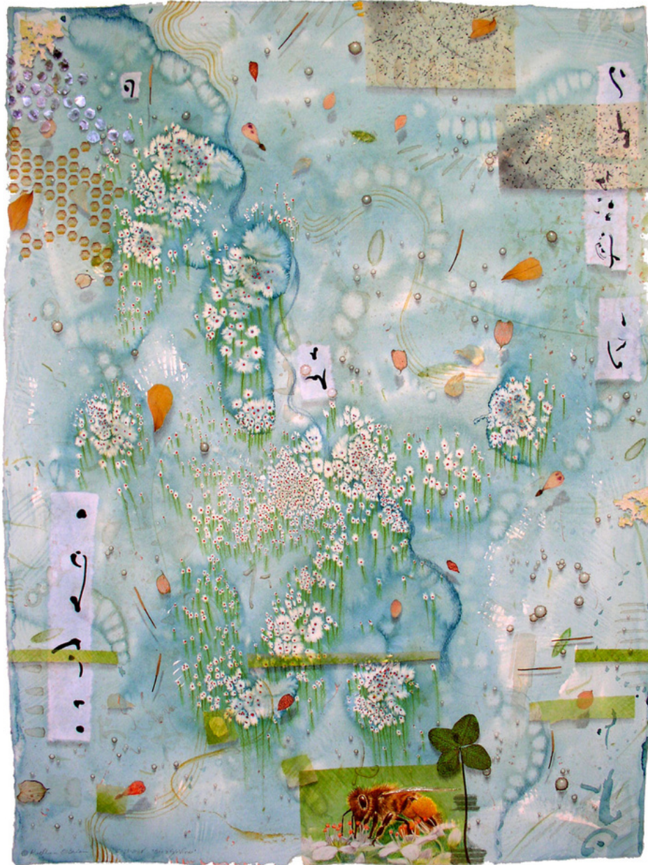
"Bee's Eye View", Kathleen O'Brien, 30x22", 2008 Private Collection